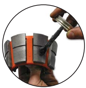
CRIMPX Die Lubricant Oil: