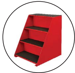
Die Storage Shelf (Optional) P/N:101431