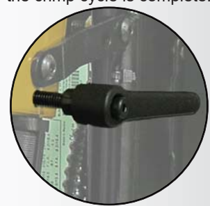
Save Time: Adjustable retraction stop limits ram retraction.