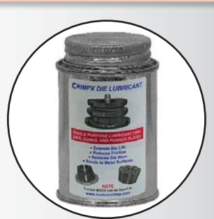
CRIMPX Die Lubricant: Grease 4 oz can with brush (Included) P/N:104162