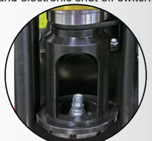
Electronic Shut Off: The crimper will shut off when the crimp cycle is complete.