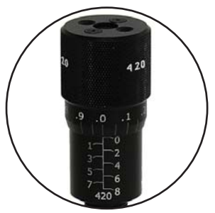
T420 Micrometer (Included) P/N:103085

The D165-T420 Series hose crimper with its powerful 62 ton hydraulic cylinder gives it the ability to crimp up to 1-1/4" 4SP hose, and comes packed with features that make it the most productive of any crimper in its class.