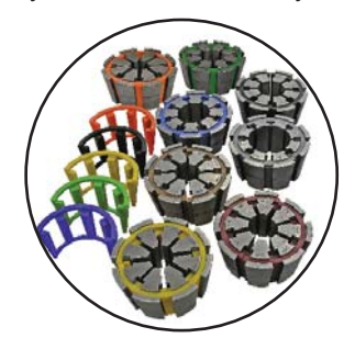
Rough Service: D160-T420 Rubber caged dies sets for heavy duty environments.