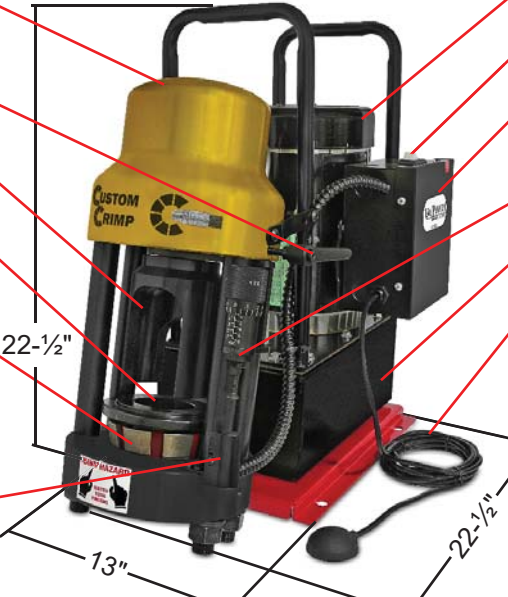
Main Power Switch