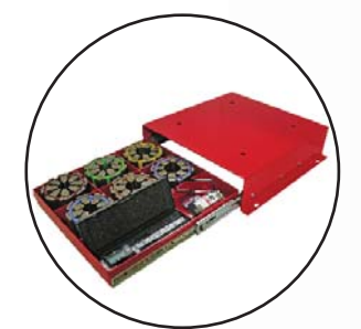
Die Storage Drawer (Optional) P/N:104650 Dies sold separately