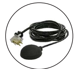
Pneumatic Pendent Switch (Included) P/N:101349