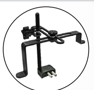
D165 Coupling Stop (Included) P/N:100954