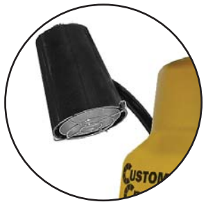
Flexible 24" Work Lamp (Optional) P/N:1668-02