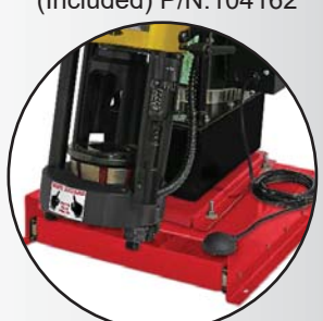
Crimper shown mounted on the Die Storage Drawer